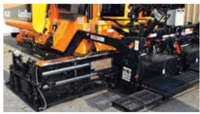
NEW LEGEND HD PRO SCREED