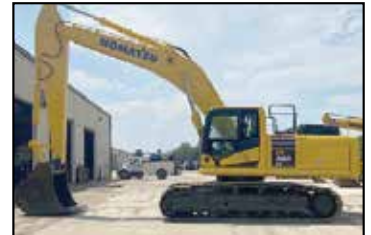
2014 KOMATSU PC360LC-10 $199,500 STK# KM19566, 3,893 HRS, SPRINGFIELD, IL