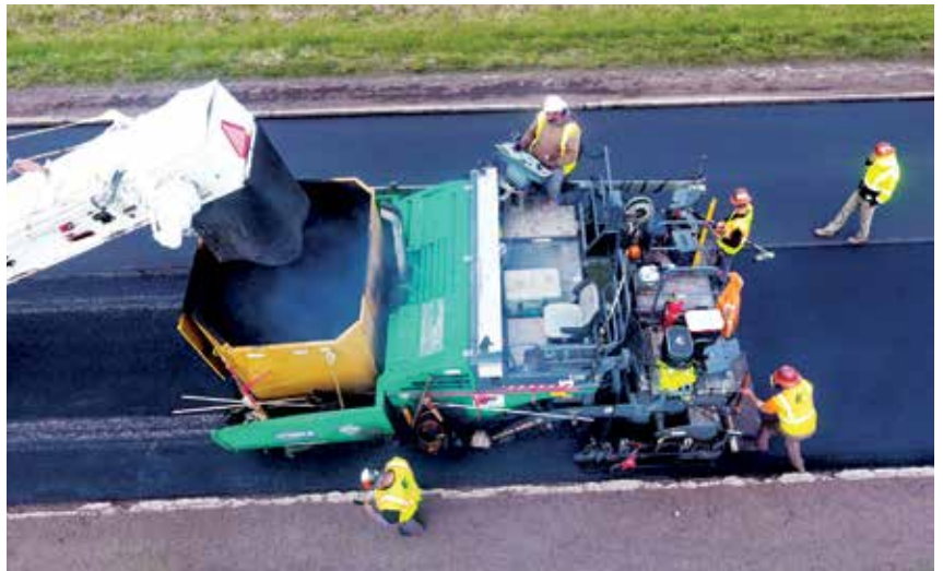
An IPC crew lays asphalt on U.S. Route 52 with a VÖGELE VISION 5200-2i paver.

"Our employees do a great job and deserve a world of credit for their ability to complete jobs on time and on budget — and to whatever the mix specifications are," said Redeker. "Thanks to their expertise, we have some of the best numbers on record with the state DOT when it comes to road smoothness. That's a real source of pride for us. We also take pride in maintaining a safe work