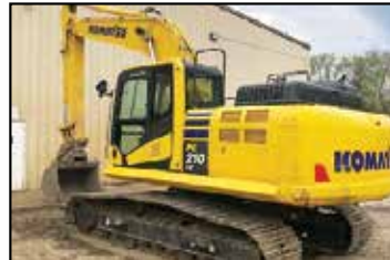
2020 KOMATSU PC210LC-11 $239,500 STK# KM2022040, 682 HRS, EAST PEORIA, IL