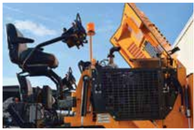
EASY ACCESS FOR ROUTINE MAINTENANCE