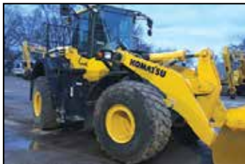
2020 KOMATSU WA480-8 $359,500 STK# KM2021809, 2,760 HRS, SPRINGFIELD, IL