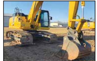
2019 KOMATSU PC210LC-11 $239,500 STK# KM2022030, 151 HRS, PALMYRA, MO