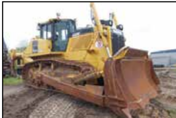
2015 KOMATSU D155AX-8 $349,500 STK# KM17233, 3,983 HRS, BRIDGETON, MO