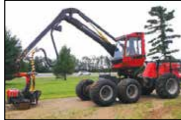
2015 KOMATSU 931.1 $275,000 STK# VT19025, 7,957 HRS, ESCANABA, MI