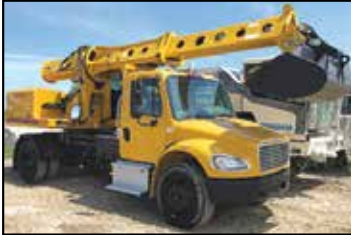
2018 GRADALL D152 $215,000 STK# ZZ18177, 28 HRS, EAU CLAIRE, WI