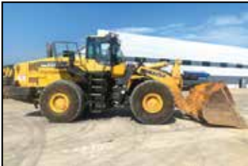
2012 KOMATSU WA500-8 $84,500 STK# KM21042, 24,169 HRS, BRIDGETON, MO