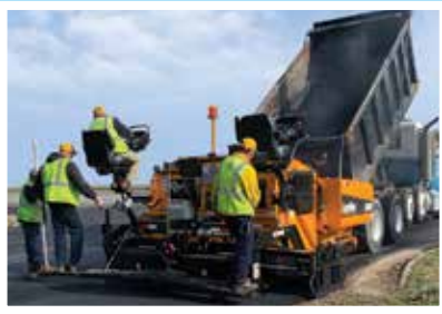
125HP HEAVY COMMERCIAL PAVER