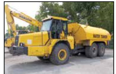
2004 KOMATSU HM300-1 $149,500 STK# KM17369, 10,978 HRS, CAPE GIRARDEAU, MO