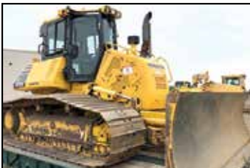
2015 KOMATSU D61PX-24 $169,500 STK# KM20131, 5,474 HRS, DEPERE, WI