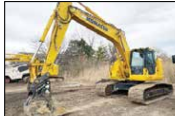
2019 KOMATSU PC238USLC-11 $199,500 STK# KM2021739, 2,618 HRS, BOLINGBROOK, IL