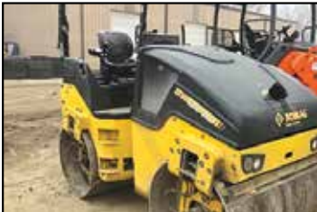
2017 BOMAG BW138AD-5 $29,500 STK# ZZ2021284, 2,226 HRS, SPRINGFIELD, IL