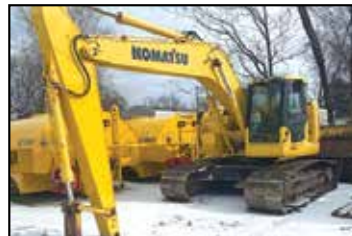
2015 KOMATSU PC228USLC-10 $149,500 STK# KM2021516, 4,061 HRS, SPRINGFIELD, IL