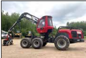
2013 KOMATSU 931.1 $200,000 STK# VT20025, 10,652 HRS, ESCANABA, MI