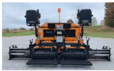
PIVOTING, MULTI-POSITION SEATS