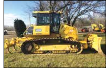
2016 KOMATSU D61PX-24 $189,500 STK# KM19412, 4,882 HRS, DEFOREST, WI