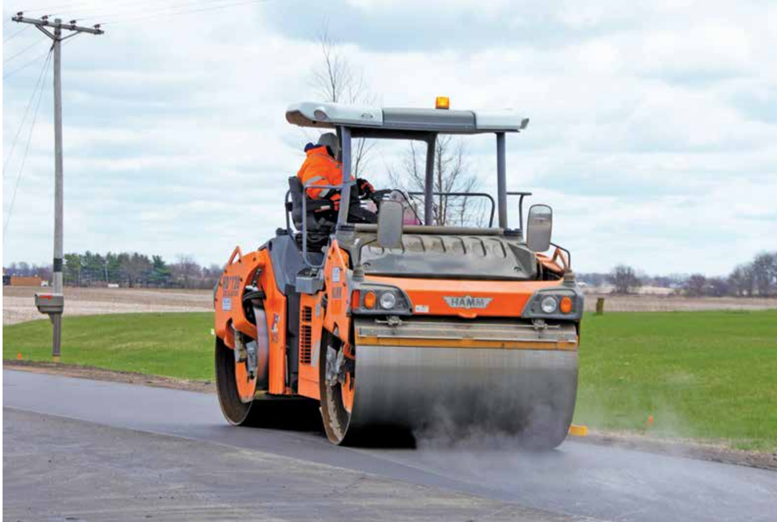
An IPC operator compacts asphalt with a HAMM HD+ 120i tandem roller.