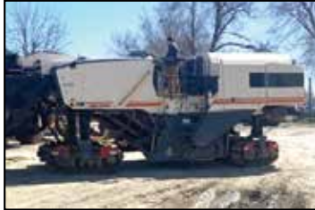
2014 WIRTGEN W220 $349,500 STK# WG20047, 3,851 HRS, SPRINGFIELD, IL